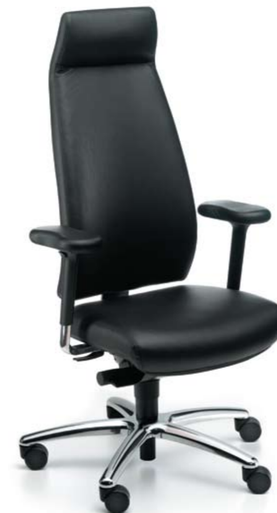
REact design by Ton Haas