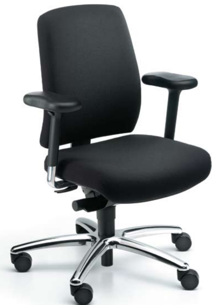
REact design by Ton Haas